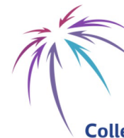
كليات التميز Colleges of Excellence